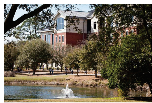
Georgia Southern University (Statesboro, Georgia)